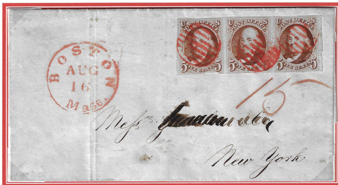
Boston to New York, NY

This 29½ mm Boston CDS is reported used from Jan. 23, 1844 to July 15, 1856.