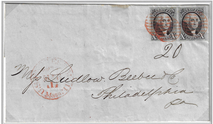
Boston to Philadelphia, Pa.

The rate of 20c was for a ½-1 oz. letter sent over 300 miles.