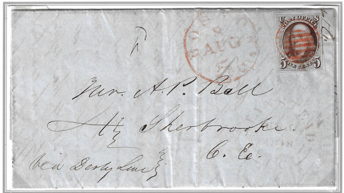
Boston via Derby Line, Vt. and Stanstead to Sherbrooke, East Canada

The 4½d Canadian paid for the 0-60 miles to Sherbrooke.