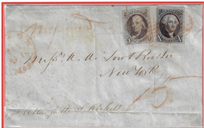
Boston to New York, NY