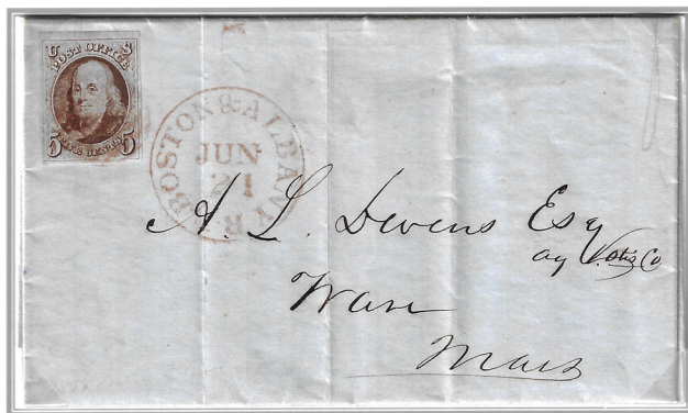
Boston to Ware, Mass.