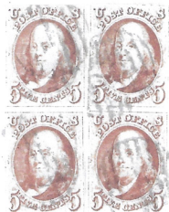
Scan @100% Reconstructed block

The two vertical pairs on the cover below were cut from a block of four.