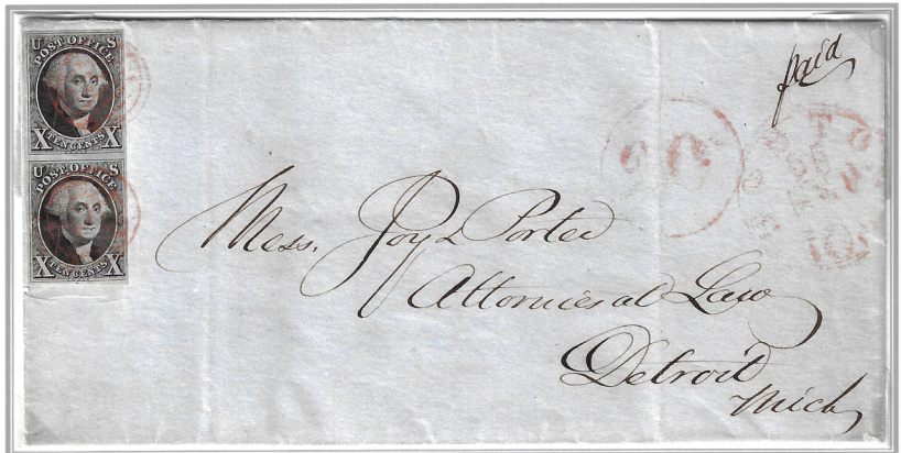
Boston to Detroit, Mich.

This "20" in circle hand stamp is reported used from Feb. 18, 1847 to Dec. 14, 1849.