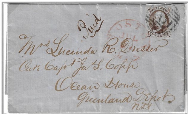
Boston to Greenland Depot. NH

This large Boston "PAID" in grid cancel is known used in black from January 16, 1852 to October 15, 1855.