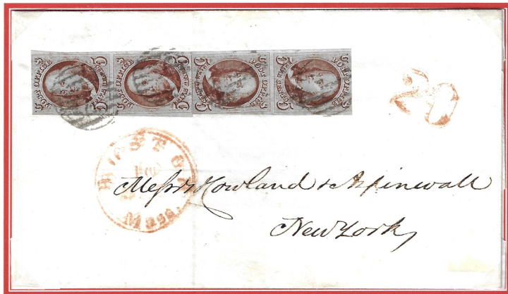
Boston to New York, NY

One of 2 reported examples of four 5c adhesives paying the quadruple under-300 mile rate from Boston