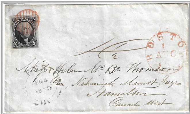
St. John, N.B. via Boston and Queenston to Hamilton, Canada West