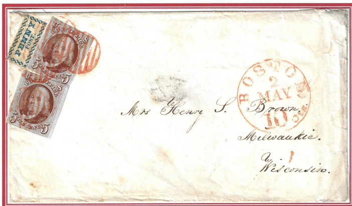
Boston, Mass. to Milwaukee, Wisc.

The penny post stamp paid for delivery to the P.O. The rate of 10c was for a ½ oz. letter sent over 300 miles.