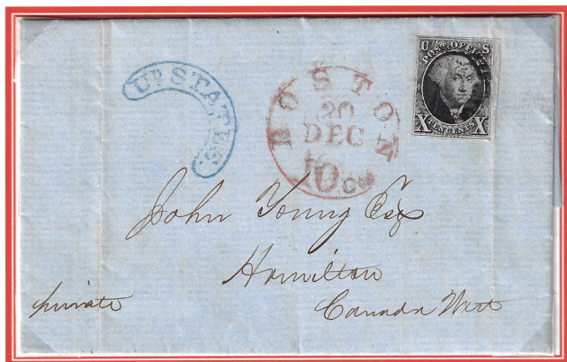
Boston via Buffalo to Hamilton, Canada West

The small Boston "PAID" in grid cancel is known used in black from July 12, 1851 to Jan. 15, 1852.