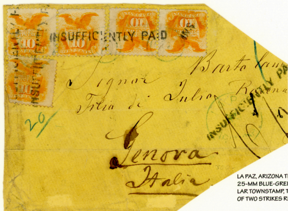
LA PAZ, ARIZONA TERRITORY. 25-MM BLUE-GREEN CIRCULAR TOWNSTAMP, THE LATER OF TWO STRIKES RECORDED.

AT LEFT, FRAGMENT OF A COVER ORIGINATING AT WILLIAMS CREEK, BRITISH COLUMBIA. THE B.C. 25¢ OVERPRINT STAMP PAID POSTAGE TO THE U.S. ENTRY POINT AT PORT TOWNSEND, WASHINGTON TERRITORY.