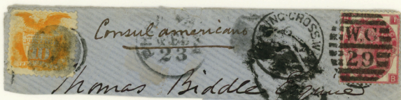
PIECE OF COVER FROM ENGLAND TO PHILADELPHIA, FORWARDED TO CUBA