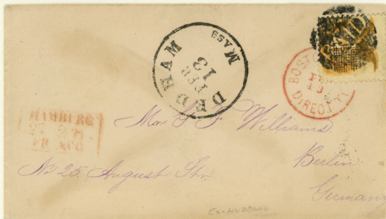
DEDHAM, MASS., 13 FEB. 1871, NEGATIVE "PAID" IN SHIELD WITH STARS, ON COVER TO BERLIN. VERY FEW FANCY CANCELS KNOWN ON 10¢ '69 COVERS.