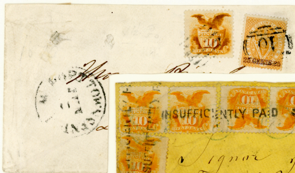
PORT TOWNSEND, WASHINGTON TERRITORY, JUNE 3 [1870].

AT LEFT, FRAGMENT OF A COVER ORIGINATING AT WILLIAMS CREEK, BRITISH COLUMBIA. THE B.C. 25¢ OVERPRINT STAMP PAID POSTAGE TO THE U.S. ENTRY POINT AT PORT TOWNSEND, WASHINGTON TERRITORY.