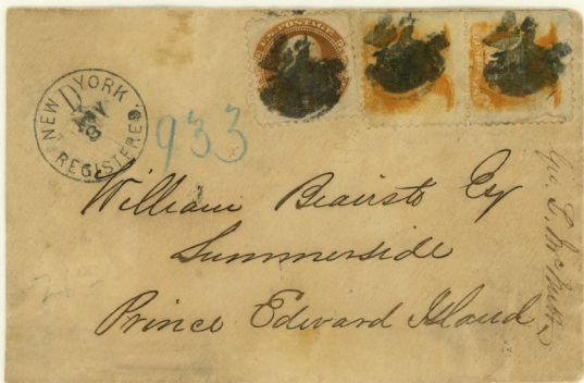
REGISTERED COVER: NYC/SUMMERSIDE, PRINCE EDWARD ISLAND, 3 NOVEMBER 1869. LETTER RATE WAS 6c AND REGISTRY FEE WAS 5c; THE SENDER MISTAKENLY PREPAID THE 15c DOMESTIC REGISTRY FEE.

TO NOVA SCOTIA, SINGLE AND DOUBLE RATES. AT RIGHT: PROVIDENCE/HALIFAX, 24 JULY 1870, 10c PLUS 2c 1869 PAYING DOUBLE 6c RATE. EX COLONEL GREEN, THIS WAS THE ONLY 10c 1869 COVER IN HIS VAST COLLECTION.