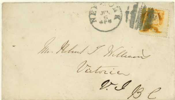
NYC/VICTORIA, VANCOUVER ISLAND, BRITISH COLUMBIA, 6 JULY 1869.

RATE: 10c PER 1/2 OZ -- EFFECTIVE PRE-1866--30 JUNE 1870