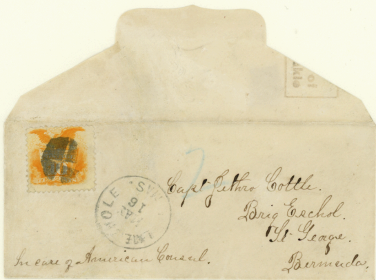
OUTBOUND: HOLMES HOLE, MASS / ST. GEORGE, BERMUDA, MAY 16, 1870. ONE OF TWO 10c 1869 COVERS RECORDED TO BERMUDA. REPAIRED COVER.

RATE: 10c PER 1/2 OZ -- EFFECTIVE 1 JUL 1851--30 JUNE 1875