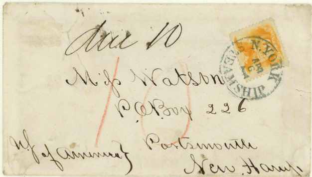
INBOUND: HAMILTON, BERMUDA/PORTSMOUTH, N.H., ARRIVING NYC 6 APRIL 1870 VIA STEAMER FAH KEE. POSSIBLY BECAUSE PREPAYMENT WITH A U.S. STAMP WAS EXTREMELY UNCOMMON ON CORRESPONDENCE FROM BERMUDA, THIS WAS MISRATED AS UNPAID, WITH 10c COLLECTED FROM RECIPIENT. ONLY RECORDED USE OF 10c 1869 STAMP FROM BERMUDA.