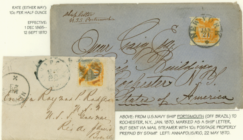
ABOVE: FROM U.S. NAVY SHIP PORTSMOUTH (OFF BRAZIL) TO ROCHESTER, N.Y., JAN. 1870. MARKED AS A SHIP LETTER, BUT SENT VIA MAIL STEAMER WITH 10c POSTAGE PROPERLY PREPAID BY STAMP. LEFT: ANNAPOLIS/RIO, 22 MAY 1870.