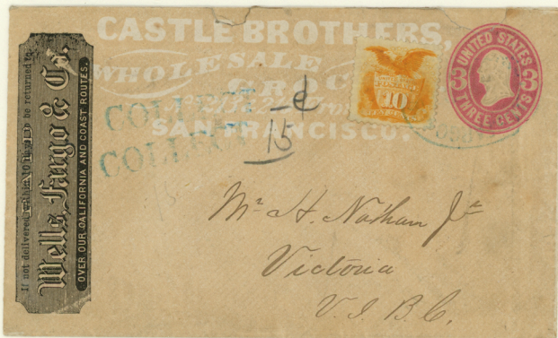
SAN FRANCISCO/VICTORIA, BRITISH COLUMBIA. PROPER USE OF 10c 1869 STAMP ON WELLS-FARGO FRANKED GOVERNMENT ENVELOPE CARRIED ENTIRELY OUTSIDE THE MAILS. ONLY RECORDED EXAMPLE OF THIS FRANKING. TWO WELLS-FARGO COVERS KNOWN WITH 10c 1869.

THIS FRAME SHOWS THE 10c 1869 STAMP ON CROSS-BORDER COVERS AND IN PAN-AMERICAN AND CARRIBEAN USES AT THE 10c STEAMSHIP RATES. TOP ROW: VARIOUS USES TO AND FROM BRITISH COLUMBIA. MIDDLE ROWS: PAN-AMERICAN STEAMSHIP COVERS SELECTED TO CONTRAST INBOUND AND OUTBOUND USES. BOTTOM ROW: COVERS TO LESSER EUROPEAN NATIONS WITH WHICH THE UNITED STATES HAD SEPARATE POSTAL TREATIES.