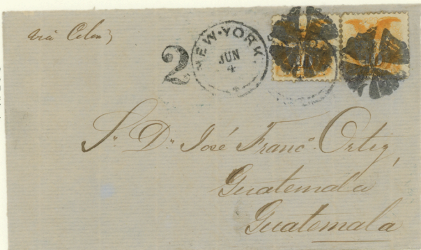
NYC/GUATEMALA CITY, 4 JUNE 1870. ATLANTIC TRANSIT TO PANAMA VIA PACIFIC MAIL STEAMSHIP ALASKA ; PACIFIC TRANSIT TO GUATEMALA CITY VIA PACIFIC MAIL STEAMER CONSTITUTION . ONLY FIVE 10c 1869 COVERS RECORDED TO GUATEMALA. DOUBLE RATE.

HANDSTAMPED 2" REALES DUE IN GUATEMALA: APPROXIMATELY 25c U.S.