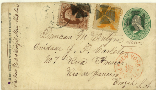
OUTBOUND: PORT GIBSON, MISS/RIO, 18 JULY 1872. WITH UNGRILLED 2c JACKSON ON 3c REAY ENVELOPE. SOLE RECORDED USE OF 10c 1869 PAYING THIS RATE.