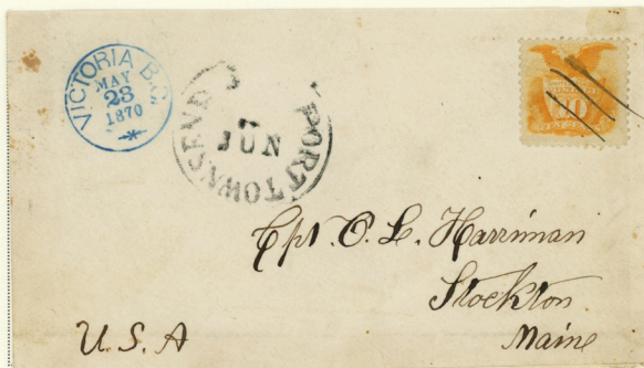
VICTORIA, B.C./STOCKTON, MAINE, 23 MAY 1870, VIA PORT TOWNSEND, WASHINGTON TERRITORY. U.S. POSTAGE PAID BY 10c 1869 STAMP. 5c B.C. POSTAGE PAID IN CASH.