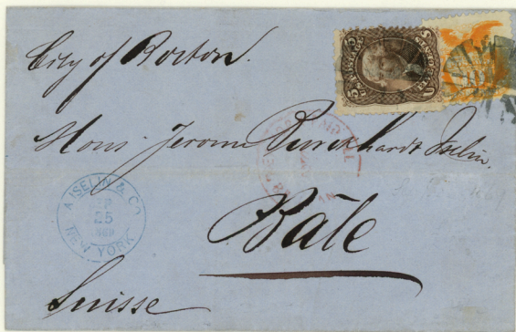
NEW YORK/BASEL, 25 SEPTEMBER 1869. 10c 1869 WITH 5c GRILLED JEFFERSON STAMP.

TO SWITZERLAND TREATY RATE: 15c PER 1/2 OZ. EFFECTIVE; 1 APRIL 1868--30 APRIL 1870