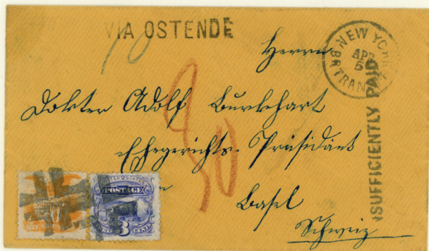
NEW YORK/BASEL, SWITZERLAND (IN OLD SWISS SCRIPT), 5 APRIL 1870. PARTIALLY PREPAID. 2c UNDER-PAYMENT (10 CENTIMES) + 20 CENTIMES FINE = 30 CENTIMES SWISS COLLECTION (RED CRAYON "30").