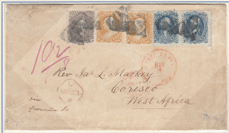
British mail, American packet via Fernando Po to Corisco Island , now claimed by Equatorial Guinea