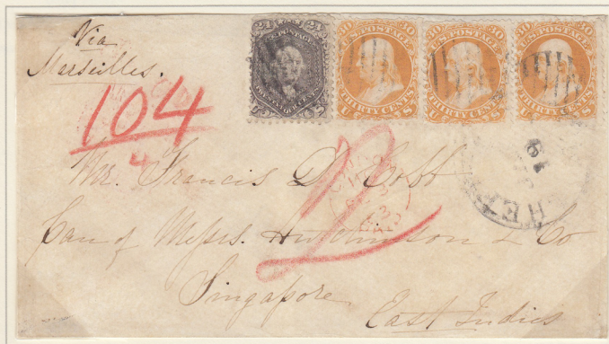
British mail, via Marseilles to Singapore, East Indies

2nd French rate step, 1st British rate step