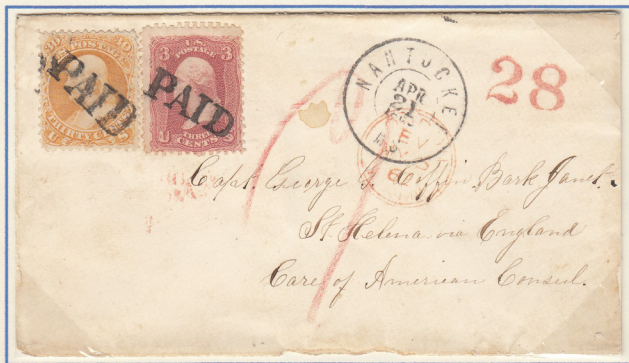
British mail, British packet to St. Helena (1200 miles West of African coast)