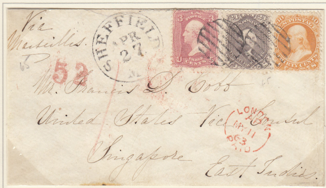
British mail, via Marseilles to Singapore, East Indies

57 cents for 1/4 -1/2 oz. 12/61 - 6/63 e