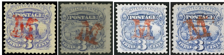
LS-M 8 red [USCC 5944] Manchester, CT 1869