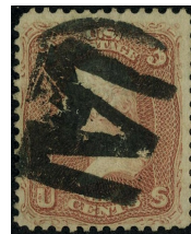
LS-M 5A 1861