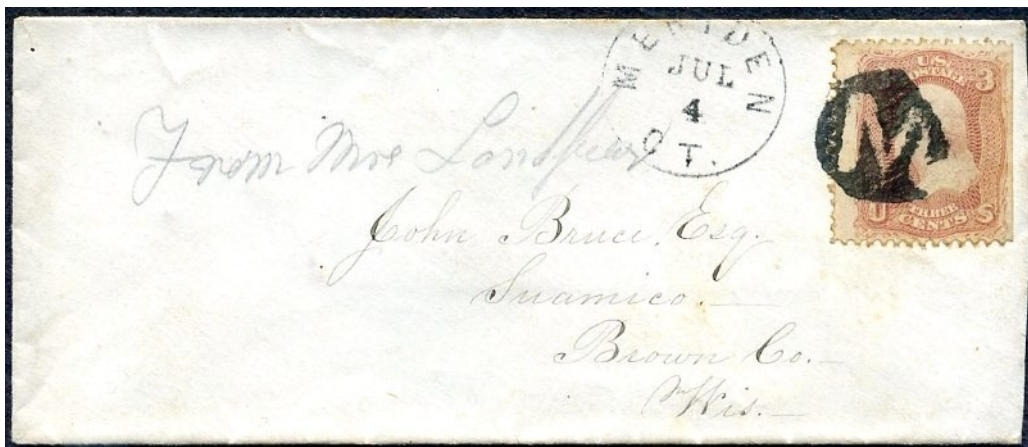
LS-M 12A 1861