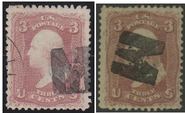
LS-M 1 [USCC 5924] 1861