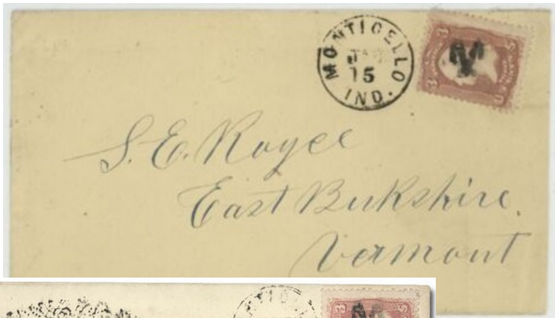
LS-M 3 1861