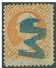
LS-M 6A 1861