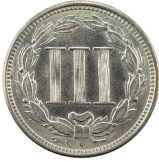
"3¢ coin" (nickle)

PO-Co 7 [USCC 6529] East Plainfield, NH 1865