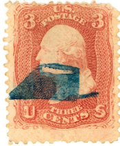
PO-Ht 9 blue [USCC 627] Worcester, MA 1861