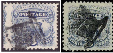
PO-Ht 7 1869