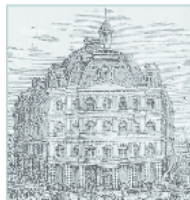
The new purpose-built New York City Post Office at City Hall Park which simultaneously opened for business on Saturday evening, Aug 28, 1875.