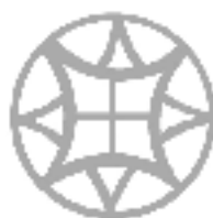
Central cross surrounded by 8 apices

Postage paid the 6¢ NGU direct mail rate.