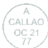
Originating datestamp on the reverse

This is the sole recorded cover known with a N.Y.C.F.M. cancel where stamps from THREE different countries were affixed to pre-pay postage.