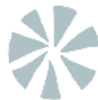
7 wedge cancel circa 1869