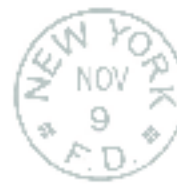
Black New York Exchange Office datestamp

The Peruvian 10 centavos stamp paid internally to Callao; the GB 6p (pence) stamp Callao to Panama; the US 5¢ stamp Panama to the US.