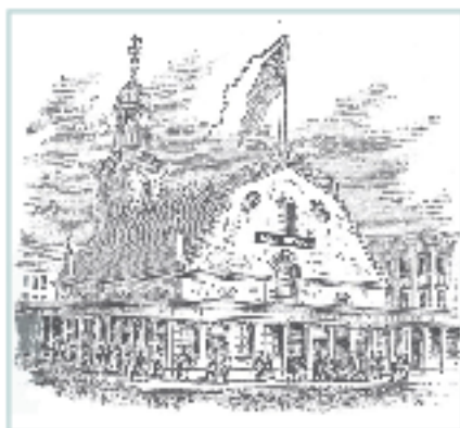
The Middle Dutch Church, home of the New York City Post Office since 1845, which closed for business on Saturday evening, Aug 28, 1875.